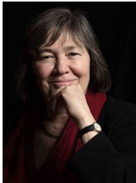
The Rt. Hon. Clare Short

The Chase School, Geraldine Road, Malvern, Worcestershire, WR14 3NZ