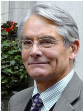
General Sir Rupert Smith

General Sir Rupert Smith has made decisive contributions to ending major conflicts. His last command was as Deputy Supreme Commander Allied Powers Europe, covering NATO's Balkan operations, including the Kosovo bombing. Prior to that he commanded the British Division in the first Gulf War 1990/1991, commanded UNPROFOR Sarajevo in 1995, breaking the siege, and commanded the Army in Northern Ireland over the period of the Good Friday agreement 1996-1998. His book The Utility of Force: The Art of War in the Modern World describes the changing nature of war as a series of linked confrontations and conflicts. He addresses the Weekend on The Utility of Force.